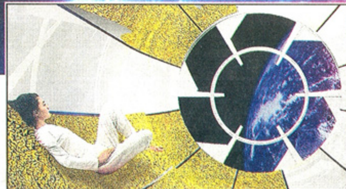
Room with a view: A Velcro suit will help defy gravity

For their money, guests will also get eight weeks of intensive training at a James Bond-style space camp on a Caribbean island.